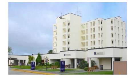
University Hospital & Clinics