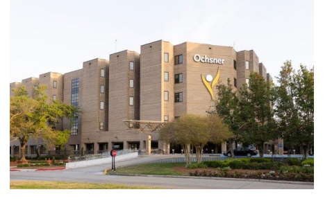
OMC – Kenner