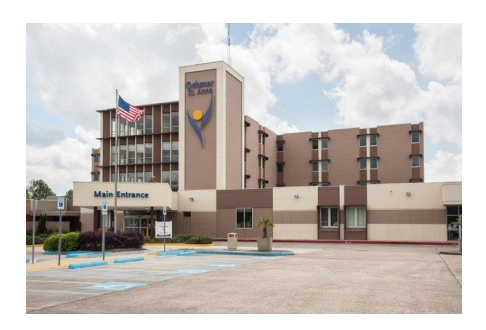
Ochsner St. Anne