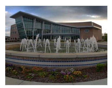
Slidell Memorial Main*