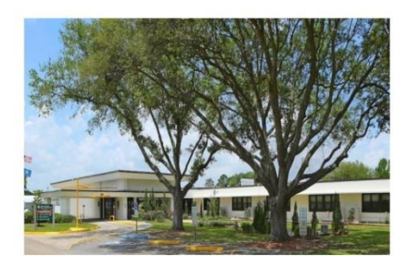
Abrom Kaplan Hospital