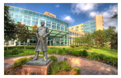
OMC – Jeff Hwy